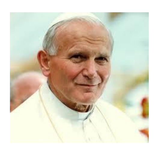
"I would now like to say a special word to women who have had an abortion.

Evangelium vitae (1995 encyclical letter "The Gospel of Life")