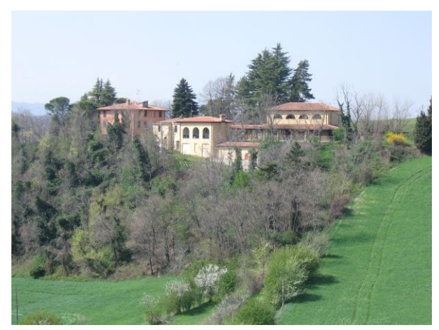
One of the two retreat houses presently used by the Italy Mission. This lovely complex is close to the city yet "removed" from daily life... a perfect pilgrimage site that helps participants take a long, loving look at their life through the eyes of faith, surrounded by the beauty of creation.

"The Lord has entrusted another child to us, perhaps one that will need a little extra love.... we and the baby's big brother are rejoicing! Your prayers helped us so much, as you can imagine the fears we had to face..."